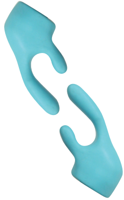
G-PLUS™ massager attachment